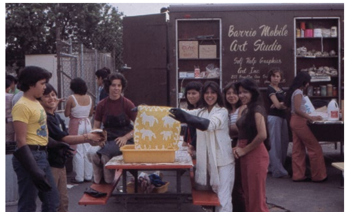
BMAS, 1970s and BMAS 2018, hosting artmaking workshops city-wide

2019 we will launch a new Art Education after school program Creative Labs, available to youth throughout the Boyle Heights and East Los Angeles area. The new program will focus on creative workforce development skill-building, including, but not limited to virtual reality, digital media, animation and printmaking to cut across all mediums. Join our e-mail list to be the first to know when the program schedule begins.