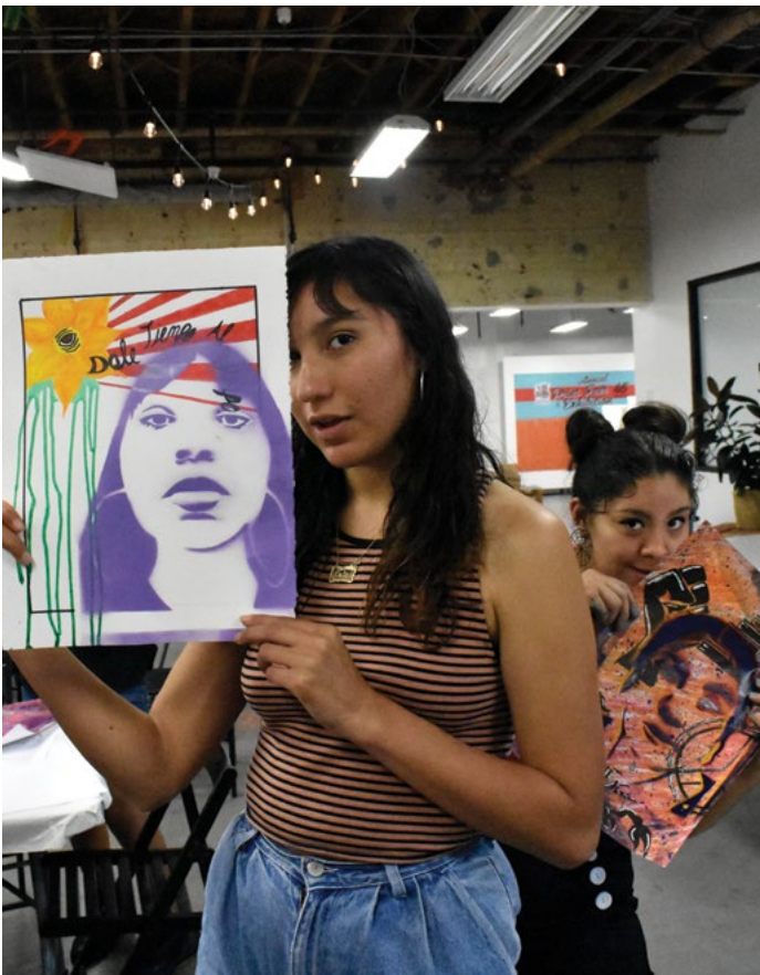
2018's Soy Artista (Summer of Youth) participants displaying their stencil portraits

Self Help Graphics & Art is a proud partner of the Getty Marrow Multicultural Undergraduate Internship program with two staff members being alumni. Aiming to encourage greater diversity in the professions related to museums and the visual arts, the Getty MUI program in Los Angeles supports substantive, fulltime summer work opportunities for college undergraduates from cultural backgrounds that have traditionally been underrepresented in the arts. The summer of 2018 we were pleased to provide internships to two undergraduates in the fields of communications and archiving. Two additional internships were made possible through the University of Notre Dame.