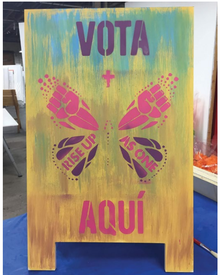
VOTE sandwich boards activation in collaboration with Task Force