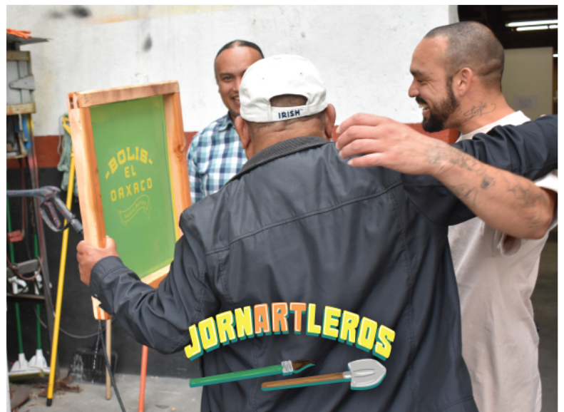
The JornARTleros project was supported by the National Endowment for the Arts. Project partners: Leadership for Urban Renewal, and the National Day Laborers Organizing Network